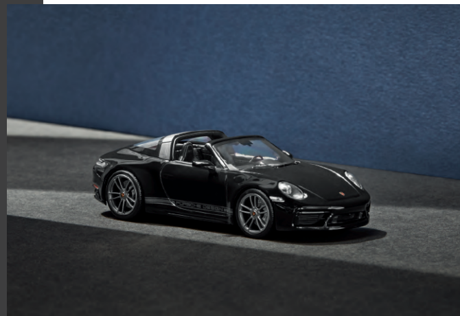
911 EDITION 50 JAHRE PORSCHE DESIGN In black. Interior in black. Made of metal. Scale: 1:43. WAP0201450NTRG