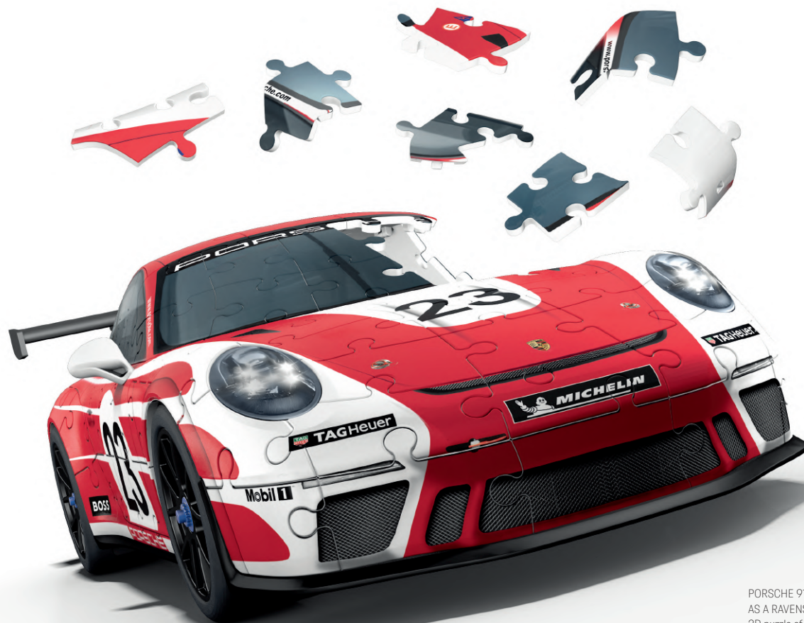
PORSCHE 911 GT3 CUP SALZBURG DESIGN AS A RAVENSBURGER 3D PUZZLE 3D puzzle of the 911 GT3 Cup Salzburg Design in the famous Salzburg livery with start number 23. Puzzle consists of 108 individually shaped pieces, with EasyClick technology. With illustrated instructions and movable wheels. For all racing drivers between 10 and 99. In red/white. WAP0400040MPCS