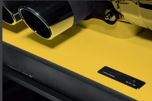
WAP0501130NSBF [Racing Yellow]