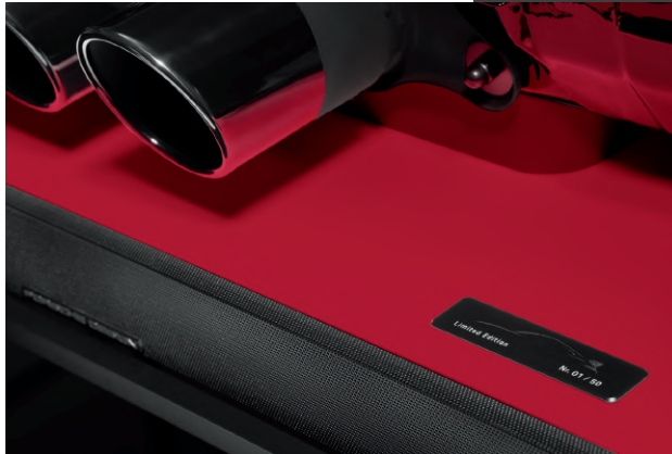
WAP0501110NSBF [Carmine Red]

Sports car enthusiasts can also enjoy the sound of a super sports car at home – with the beloved high-end sound system: the 911 Soundbar. Made from the original exhaust system of the 911 GT3, the high-end 2.1 virtual surround system uses the rear silencer and the tailpipe trim of the 911 GT3 as a resonator. And in so doing reverses the original function of the genuine parts. The result? Brilliant sound quality and a design with the power of pure sports car passion. It's not just the rich tones that are sure to catch the attention of soundbar fans – because the new 911 Soundbar Final Edition is also available in three new colours.