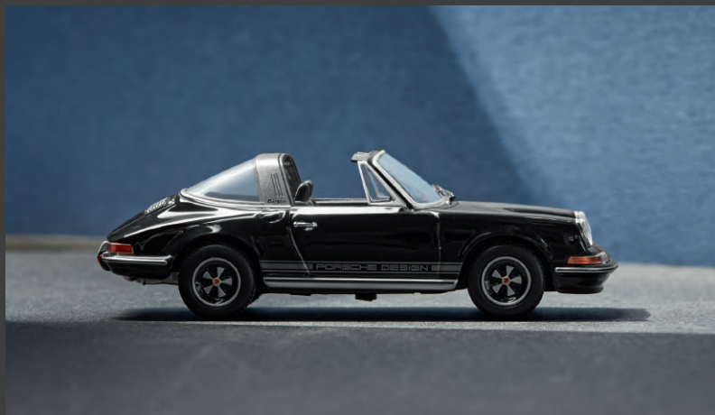
911 TARGA S 2.4 [1972] In black. Interior in black. Made of metal. Scale: 1:43. WAP0201980NTRG

The fact that top performance is also available on a small scale can be seen in the two new 50Y PD model cars which, created for the 50th anniversary of Porsche Design, will enable you to take a piece of that sports car feeling off-road, indoors with you. Because the Porsche 911 S 2.4 Targa from 1972 pays homage to the roots of the Porsche brand. And the timeless reinterpretation, the 911 Edition 50 Years Porsche Design, takes us along the racing line from the past towards the future.